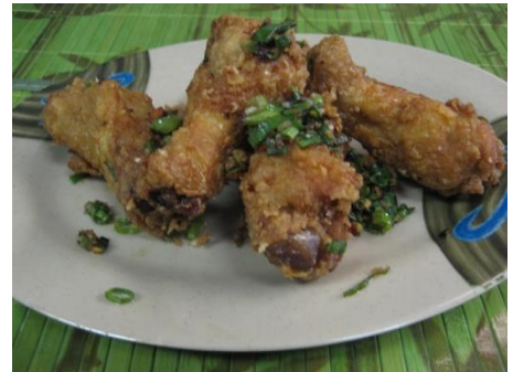
Chili Salt Chicken Wings