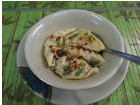
Chili Sauce Chicken Dumplings