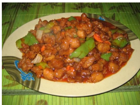
Sweet & Sour Pork