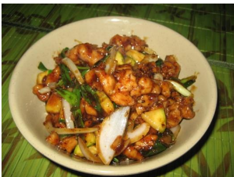
Black Pepper Chicken

Grilled boneless skinless chicken with Hawaiian sauce Slices of lean & tender beef with Hawaiian sauce Slices of pork with Hawaiian sauce Deep fried chicken with Orange sauce Sliced beef & broccoli with brown sauce Sliced chicken & broccoli with brown sauce Deep fried chicken & green peppers w/Sweet & Sour sauce Deep fried pork & green peppers w/Sweet & Sour sauce Deep fried chicken with hot sauce Sliced chicken with Szechwan sauce Sliced chicken & vegetables with light sauce Shrimp & vegetables with light sauce Sliced chicken with Teriyaki sauce Fried fish fillet with Teriyaki sauce (6pcs) Mixed vegetables with light sauce Sliced chicken & onions with Black Pepper sauce Sliced chicken & scallion with brown sauce Mixed vegetables & egg noodles with brown sauce Eggs, green onions, & green peas with rice