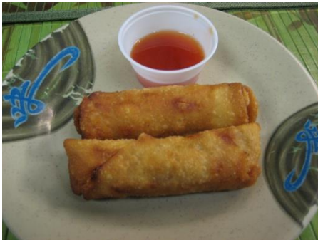
Pork Egg Rolls