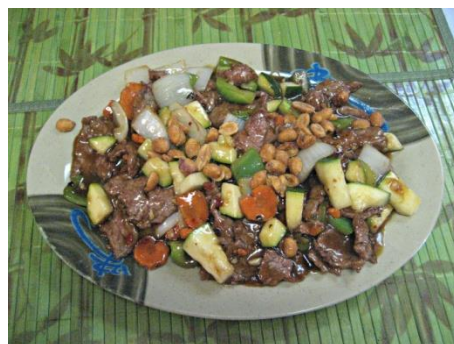
Kung Pao Beef